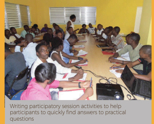
Writing participatory session activities to help participants to quickly find answers to practical questions

Better Work Enterprise Advisors will continue to support the factories in the implementation of good management systems by ensuring that the tools presented during this seminar are used