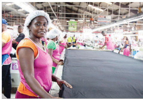
A worker at the manufacturing section of the WILLBES

of that growth." The expansion plan in Haiti goes from extending the size of the actual buildings to the construction of a new independent building in a large area close to the cafeteria area of SONAPI. The company is expecting more orders to utilize this additional production space. The new building alone will have the capacity to host around 950 workers with a cafeteria and a management office. In addition to this expansion in partnership with IDB and IFC, The Willbes is also working on setting up a new factory in two additional buildings in SONAPI. Currently, cooling systems are being installed and the machines are on their way to Haiti. Operations are expected to start in September 2016. As a long-term member of Better Work - not only in Haiti but also in other countries where The Willbes has operations - the factory is very keen on ensuring that the newly created production space will be