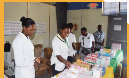
OFATMA staff gets ready to provide medical checkup and medicines to workers during the OSH week at SONAPI

good clinical practices, standards and procedures. All participating clinics will be assessed on a regular basis and every 3 months an award will be given out to the most improved clinic. The award includes a 500 US$ discount on the 2017 subscription to the BWH program. During the first round of clinic assessments, the overall best clinic at the baseline has been identified and an award was given out on 28 April. And the winner is : Horizon Manufacturing S.A.