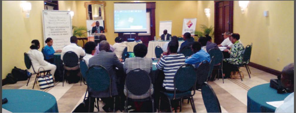
Coordination meeting between MAST inspectors and Better Work Haiti Enterprise advisors

The new Better Work assessment calendar has also been presented and discussed with the labor inspectors in order to plan the shadowing of Better Work assessments by the MAST labour inspectors. To this end, several half-day sessions have already been conducted by Better Work Enterprise Advisors for and together with the labor inspectors. During those workshops, both teams shared their experience in the assessment