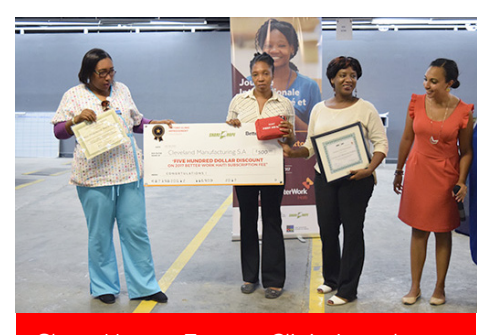
Share Hope - Factory Clinic Award Cermony to Clevland Manufacturing S.A