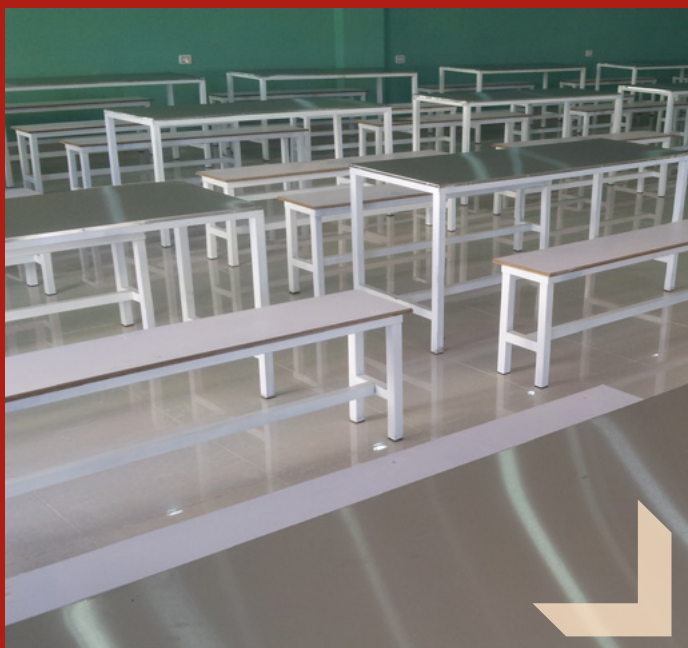
Workers' center canteen

The centre is managed by the National Workers' Centre Association, which includes government, employer, and union representatives, as well as BWJ. It will oversee the overall operation of the centre and possibly others like it in the future. It will be financed through contributions by factories and worker membership fees as well as through the sales of goods and services.