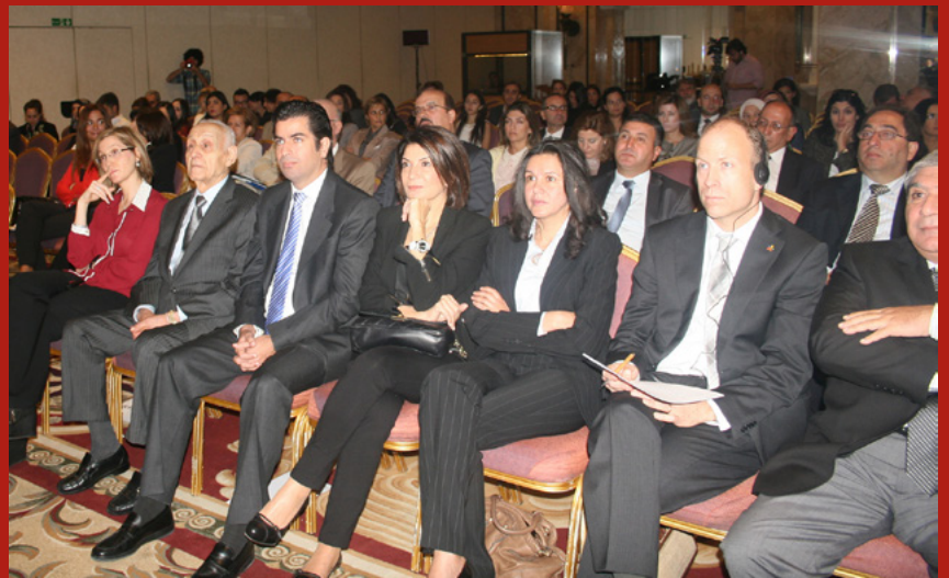
ILO child labour corporate social responsibility workshop October, 2013 - Amman, Jordan

In 2012, only one garment factory in Jordan was found to be in violation of child labour standards. Following advice from BWJ's Enterprise Advisors, the factory in question quickly remedied these violations.