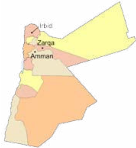
The three primary QIZs in Jordan are located near the cities of Amman, Irbid, and Zarqa.

The Centre will provide workers with low-cost or free access to recreational facilities, training, legal services, and mental health and psychosocial services. The plan is to launch the Workers' Centre by the end of the summer. There are plans to replicate the concept in the country's two other major QIZs once the value and viability of the pilot Worker Centre in Al Hassan are demonstrated.