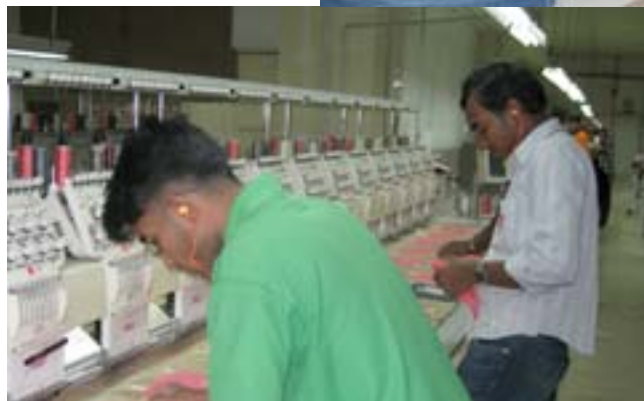
Occupational Safety and Health (OSH) includes protective measures employees can take such as wearing face masks and earplugs.