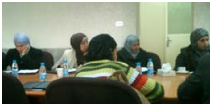
Union members learn how to set strategic goals

A second workshop was held in March to develop and implement a strategy for activating factory-level Occupational Safety and Health (OSH) Committees and strengthening the role of worker representatives on these committees. Participants at the workshop identified key OSH concerns observed during their factory visits and went on to recommend strategies to increase OSH awareness and participation. In the days following the workshop, participants visited factories to solicit more in-depth feedback from OSH committee members on the major health and safety concerns affecting workers, obstacles to addressing these concerns, and effective strategies for reaching out to workers and management. In the coming weeks, Better Work Jordan will use this feedback to help the union launch a campaign to strengthen OSH committees and to expand its own program to educate workers and managers on improving occupational safety and health at the workplace and in dormitories.