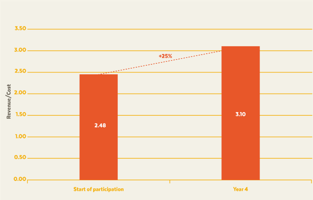
FIGURE 4 BETTER WORK IMPACT ON PROFITABILITY

Note: The cumulative Better Work effect on the revenue-cost relationship is 0.62 on a mean of 2.48 at the fourth year, indicating a 25 percent increase in the ratio of revenue to cost.