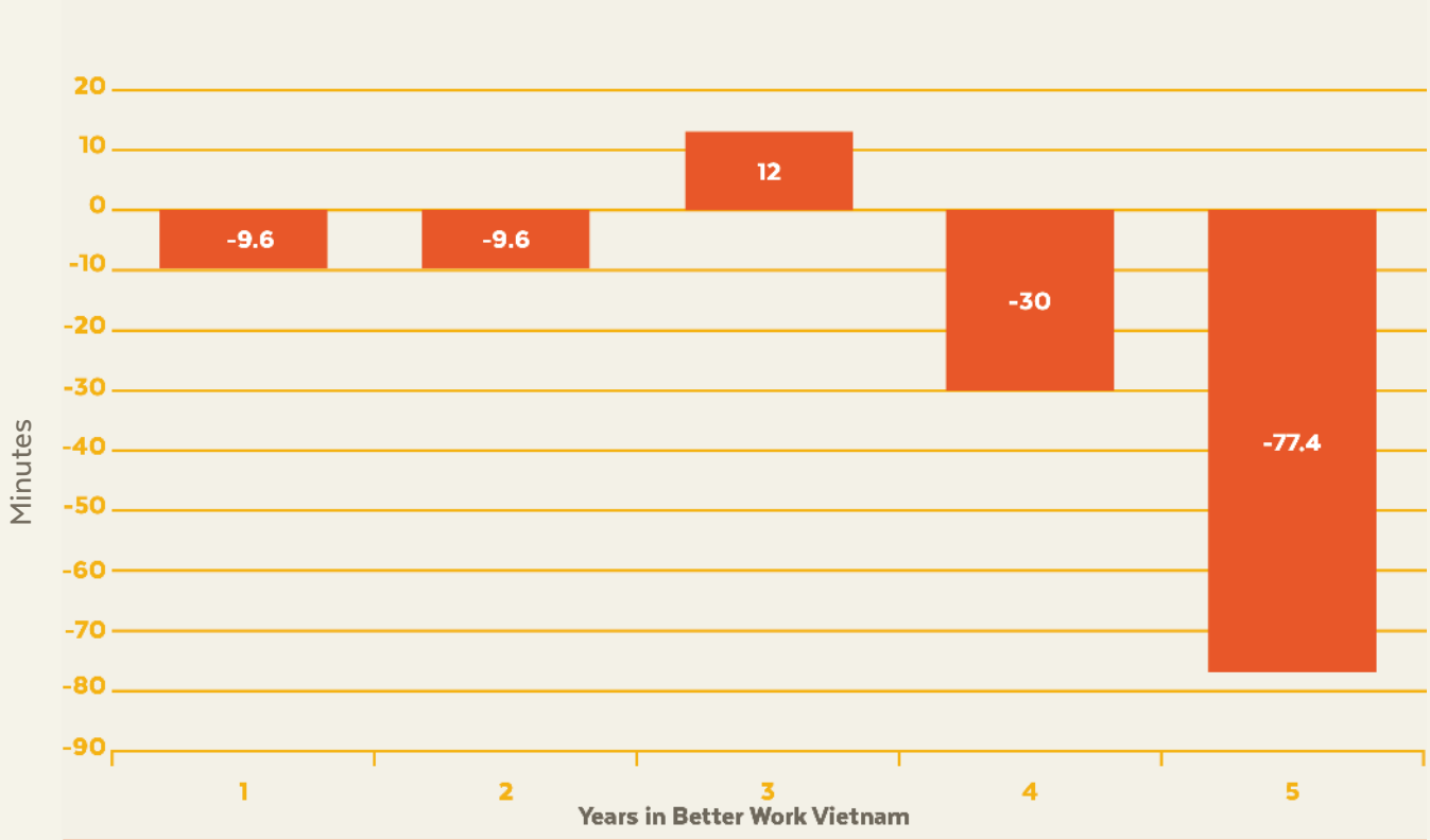
FIGURE 1 BETTER WORK IMPACT ON WORKERS' TIME TO REACH THEIR PRODUCTION TARGETS

Individual worker productivity also increases as verbal abuse is eradicated in the work setting. Evidence from Vietnam shows that if workers are concerned by verbal abuse, they take almost one extra hour per day to reach their production target. This is taking into account their education, training and experience.