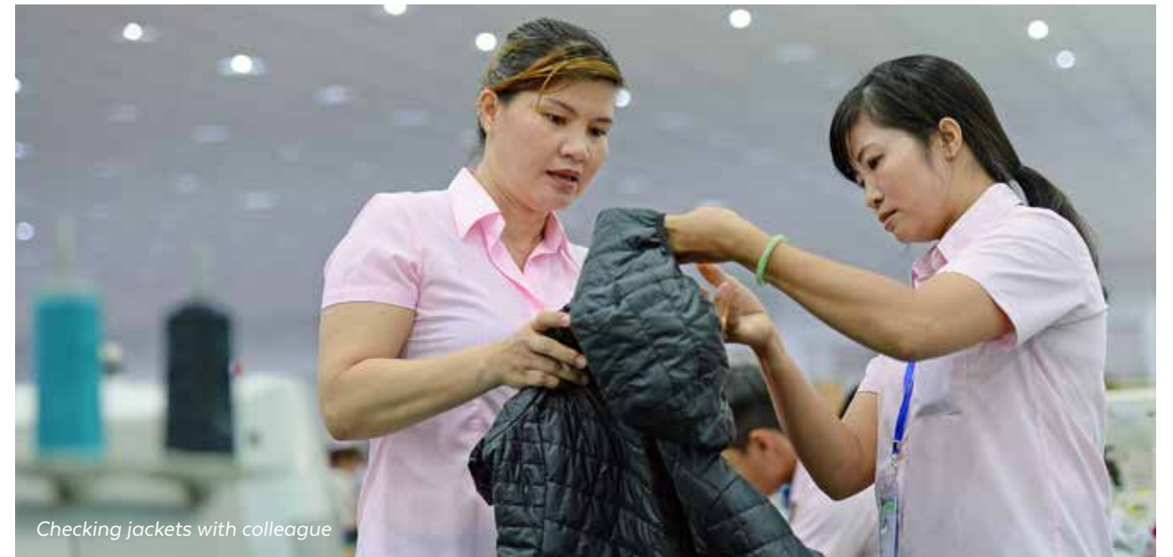
Checking jackets with colleague