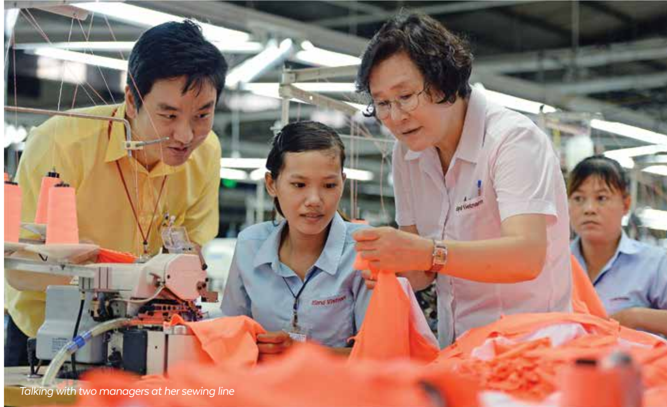
Talking with two managers at her sewing line