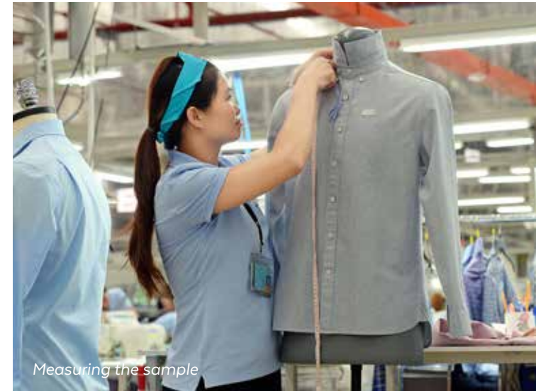
Measuring the sample