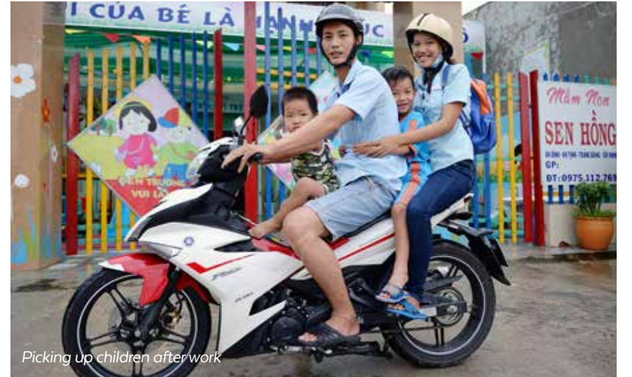
Picking up children after work