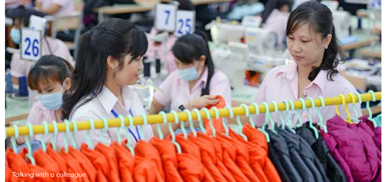
Talking with a colleague