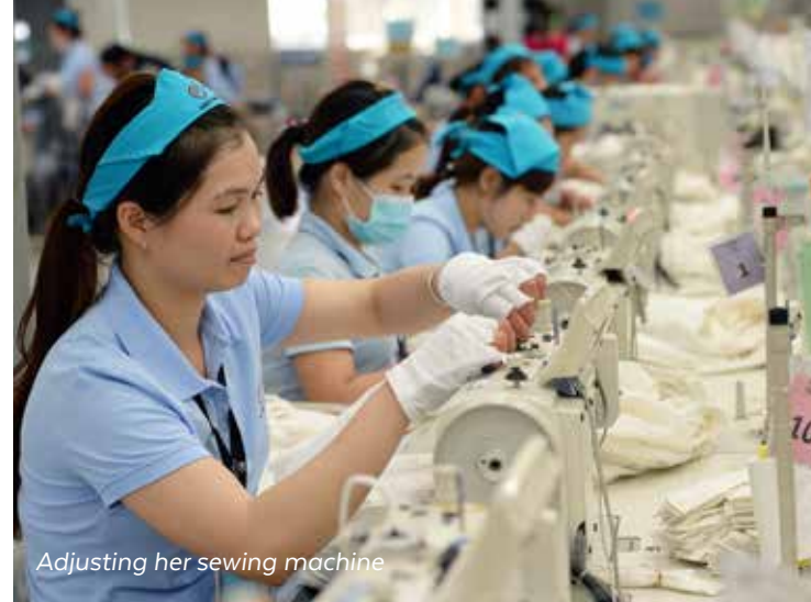
Adjusting her sewing machine