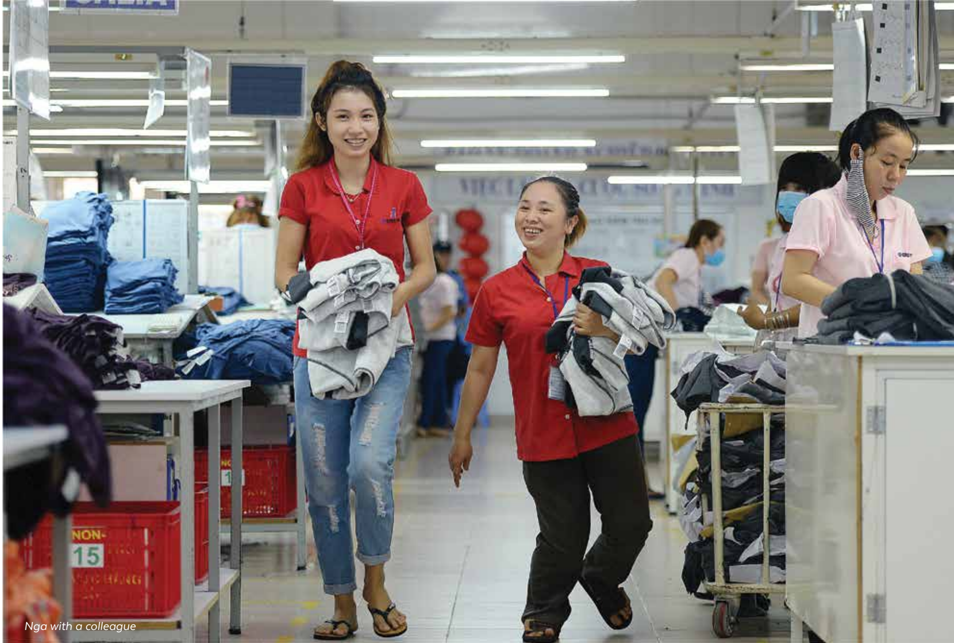
Nga with a colleague