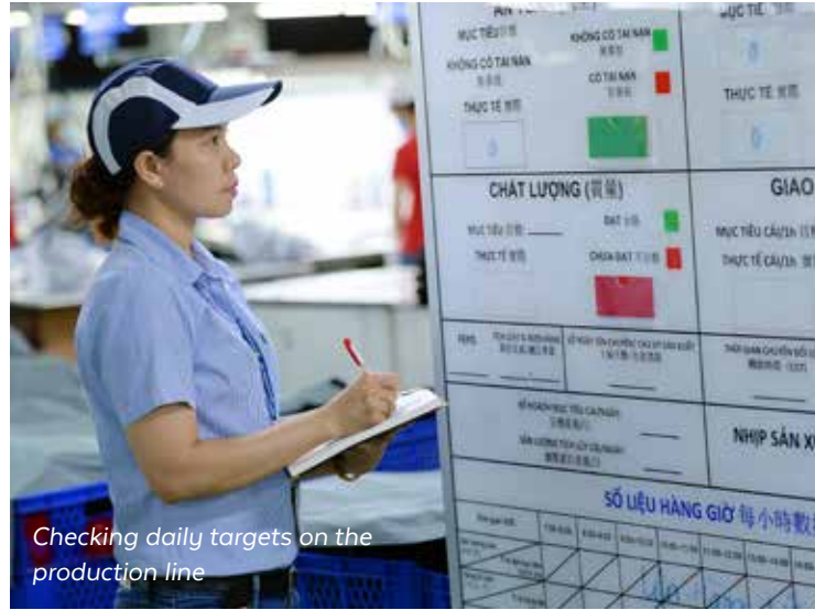
Checking daily targets on the production line