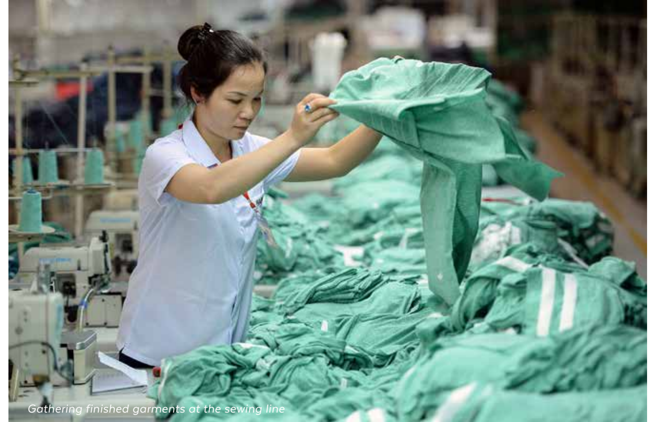
Gathering finished garments at the sewing line