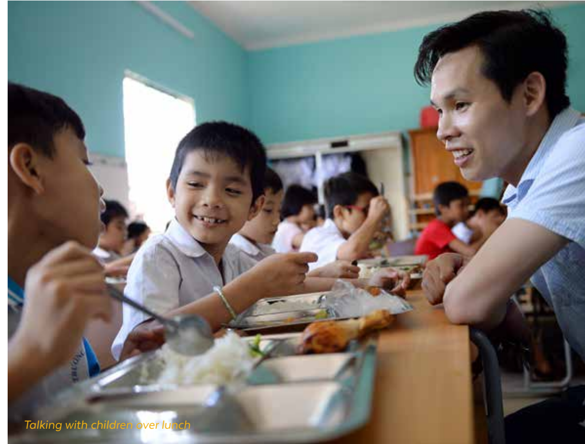
Talking with children over lunch