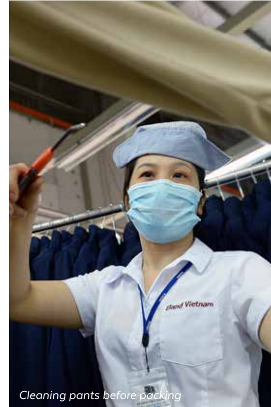
Cleaning pants before packing