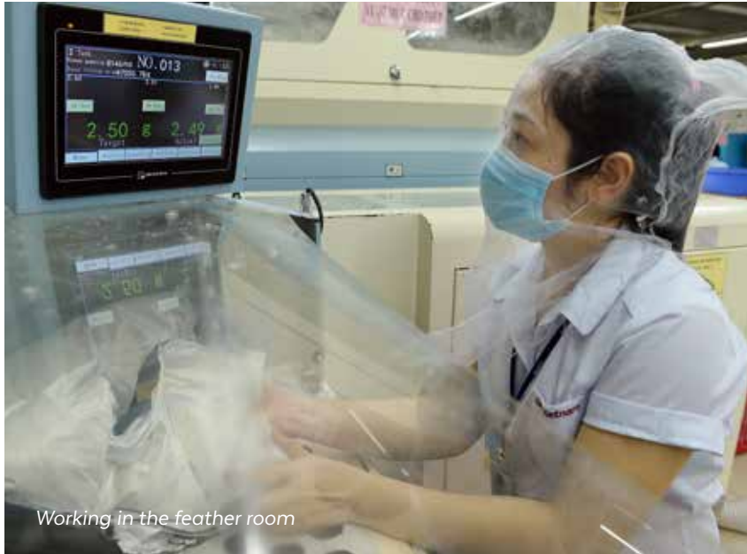
Working in the feather room