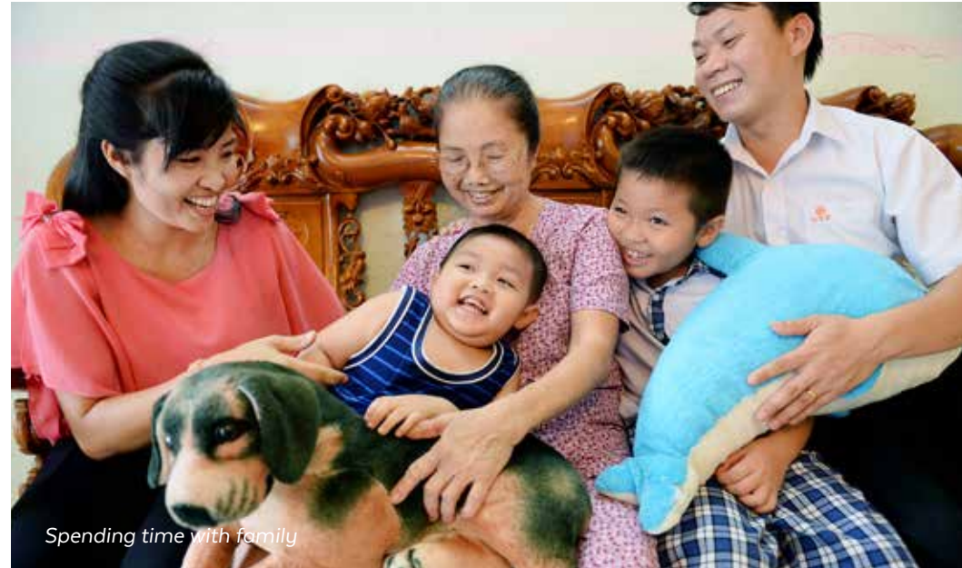
Spending time with family