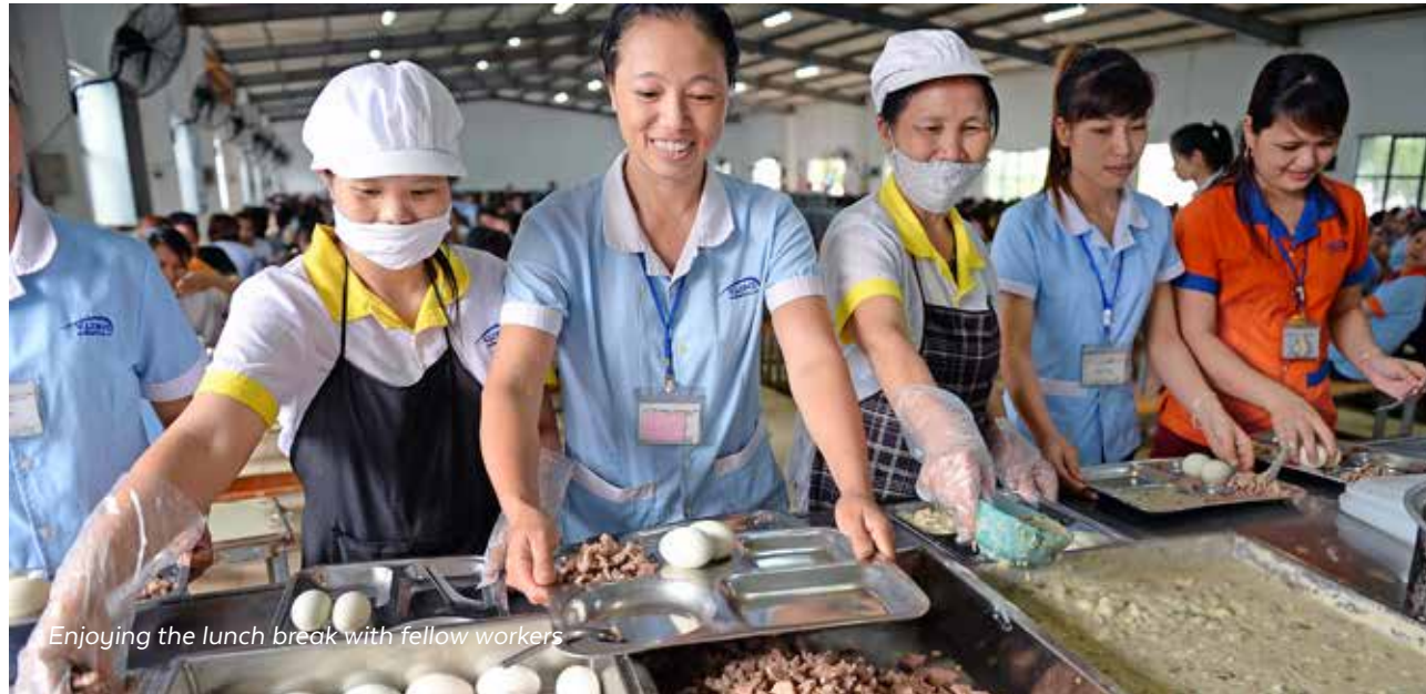
Enjoying the lunch break with fellow workers