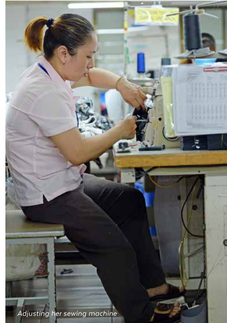
Adjusting her sewing machine