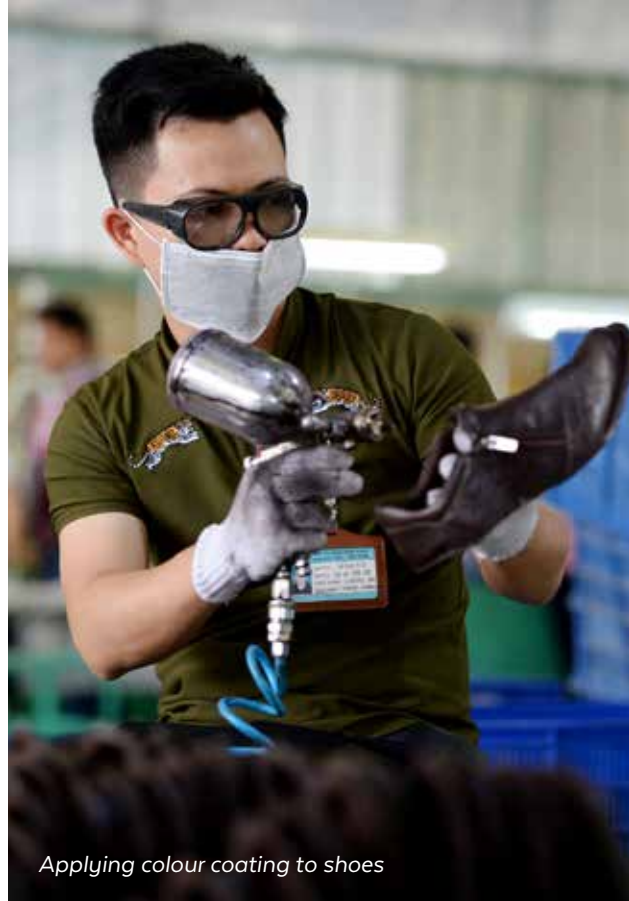
Applying colour coating to shoes