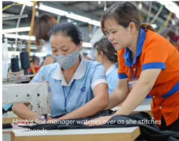
Hanh's line manager watches over as she stitches waistbands