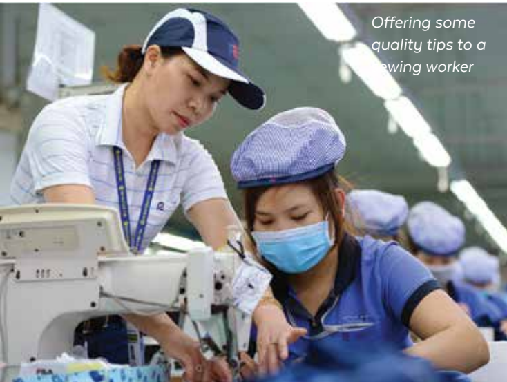
Offering some quality tips to a sewing worker