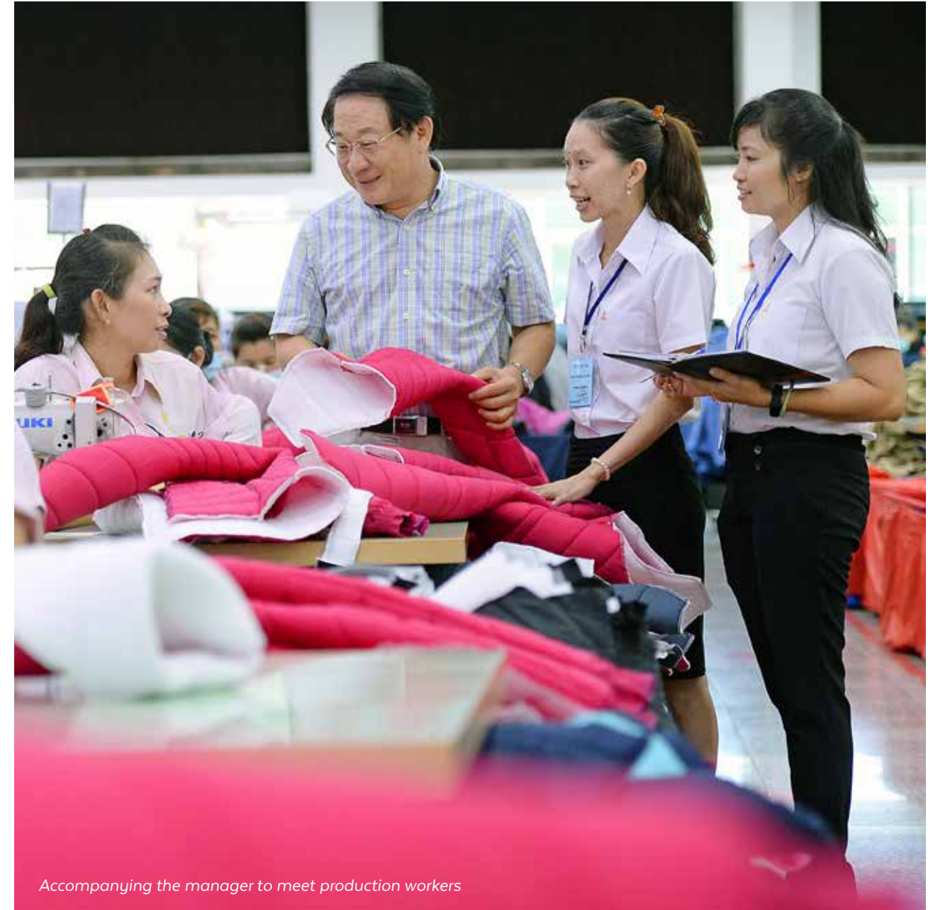
Accompanying the manager to meet production workers

“ I hope I can help workers to improve their life while contributing to the factory too. I'm also keen to learn new skills and knowledge that will help me do my job better.”