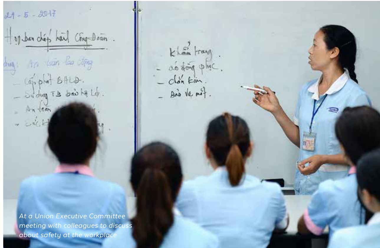
At a Union Executive Committee meeting with colleagues to discuss about safety at the workplace