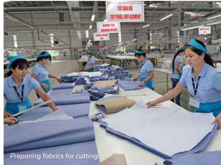
Preparing fabrics for cutting