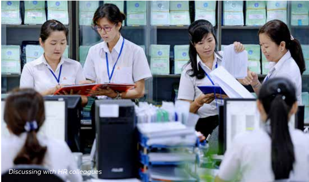
Discussing with HR colleagues