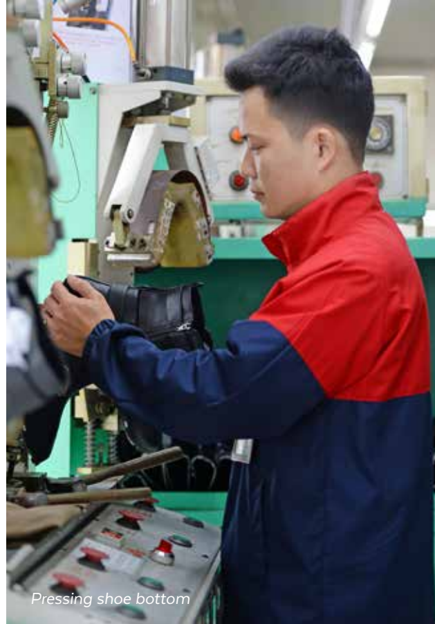
Pressing shoe bottom