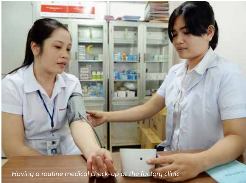
Having a routine medical check-up at the factory clinic