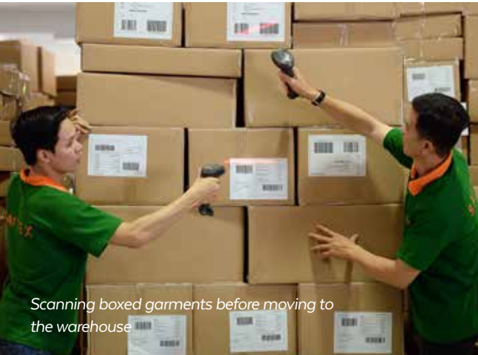
Scanning boxed garments before moving to the warehouse