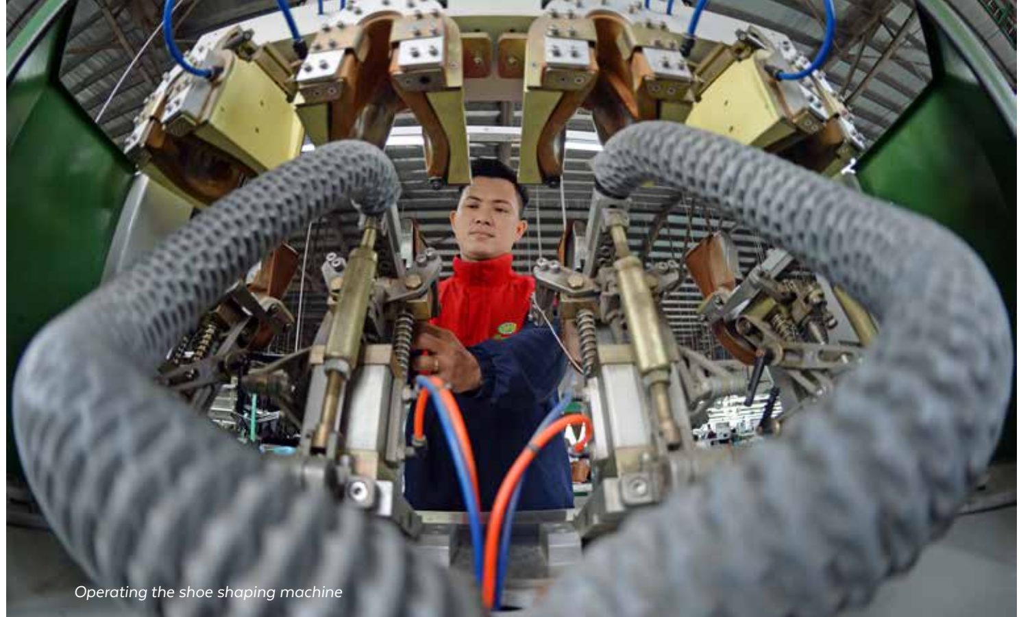
Operating the shoe shaping machine