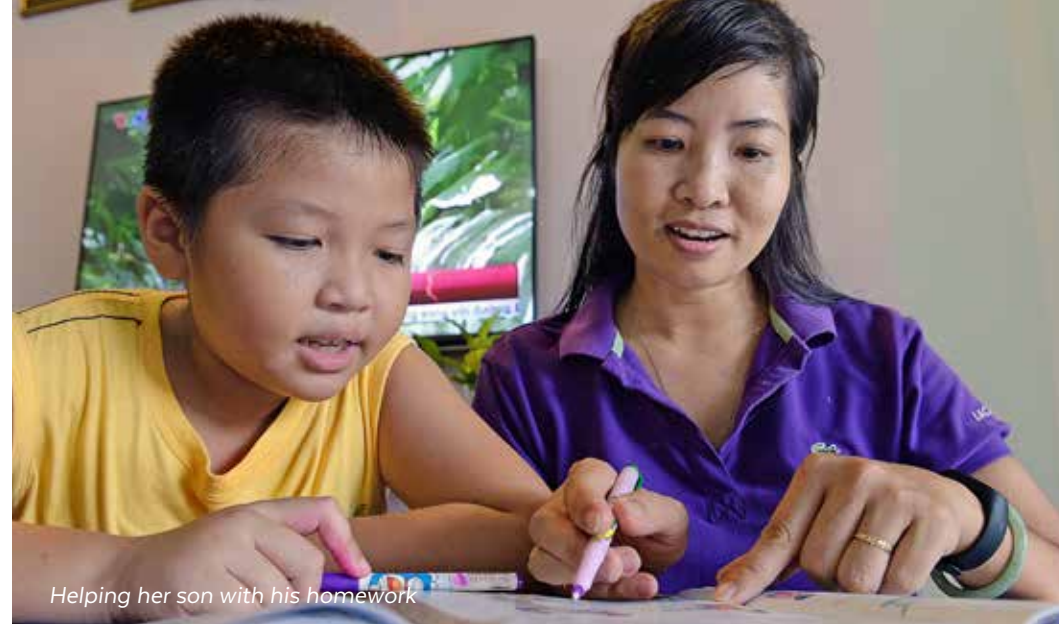
Helping her son with his homework