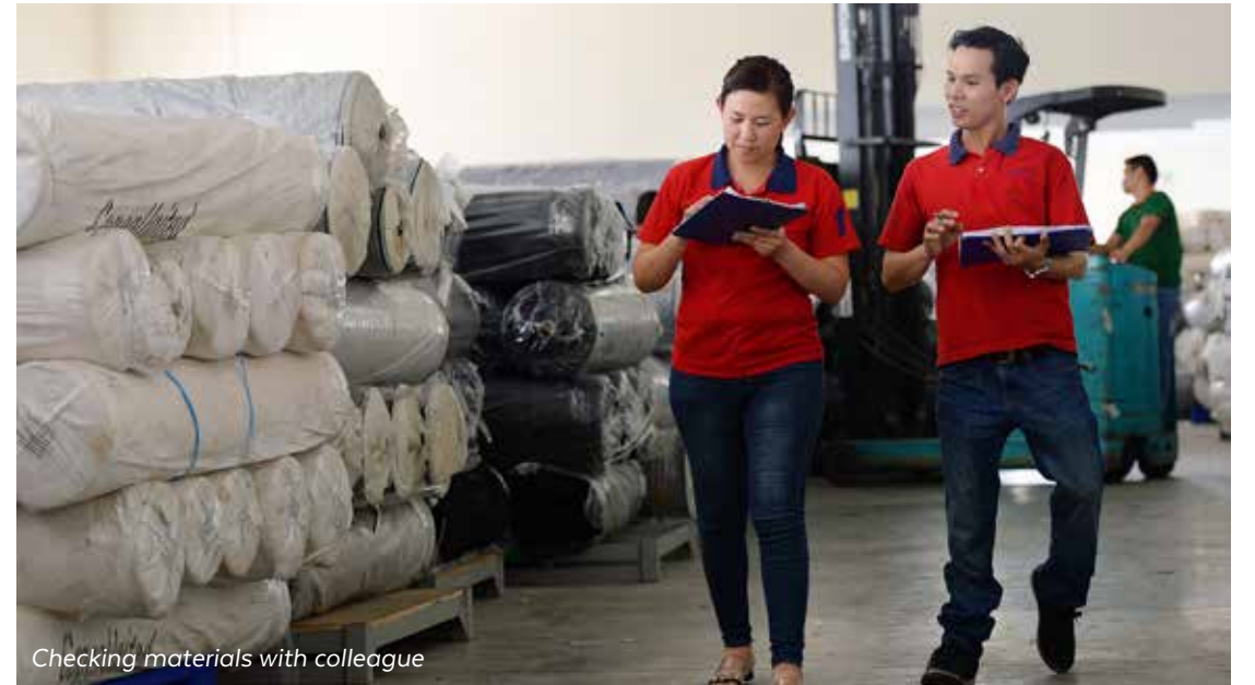
Checking materials with colleague