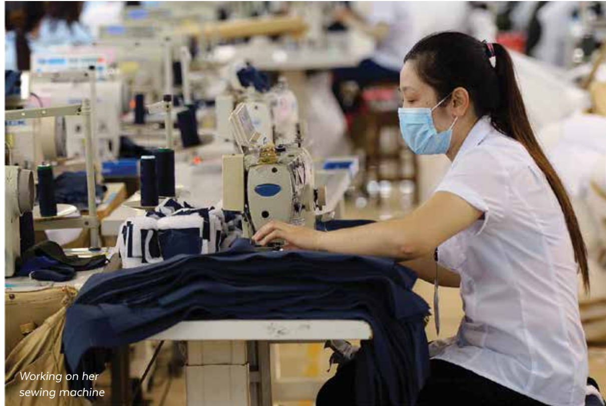
Working on her sewing machine