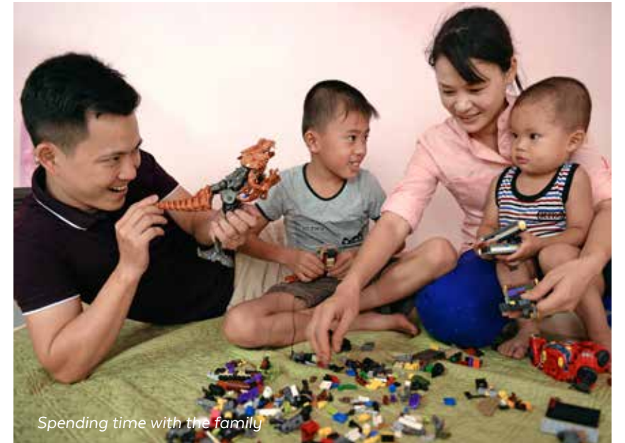
Spending time with the family