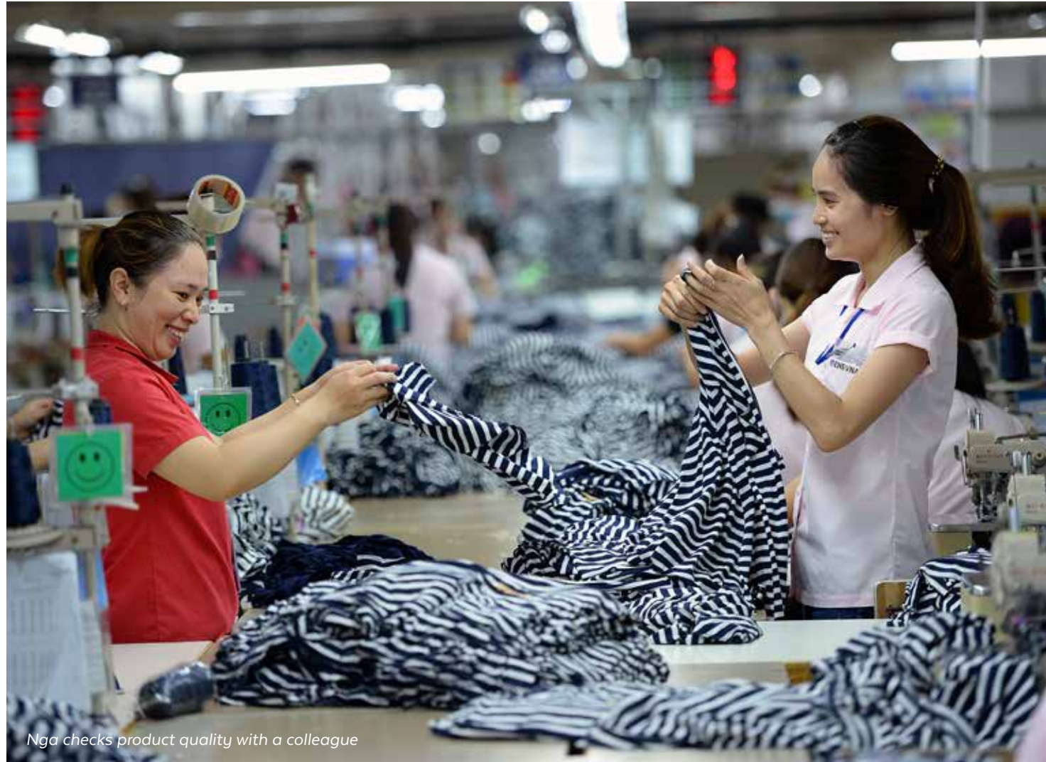
Nga checks product quality with a colleague