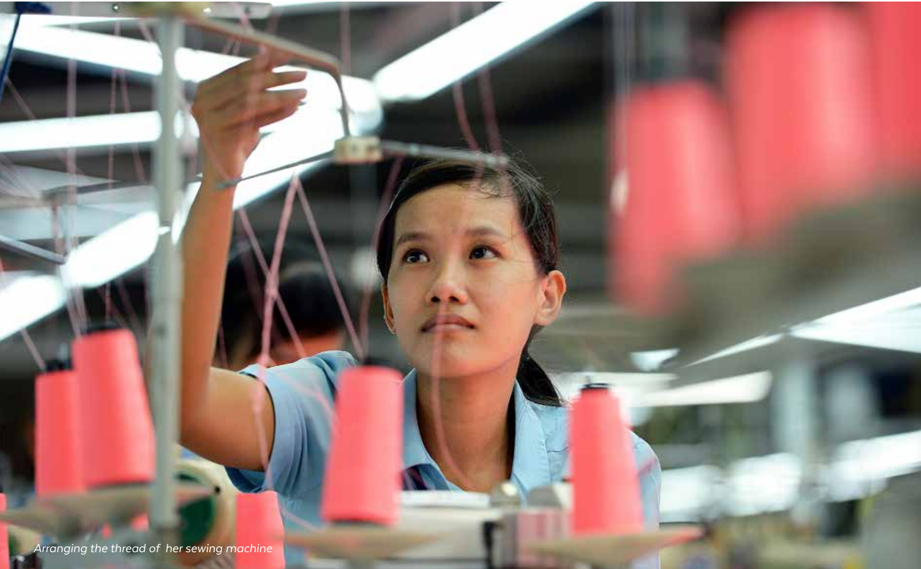
Arranging the thread of her sewing machine