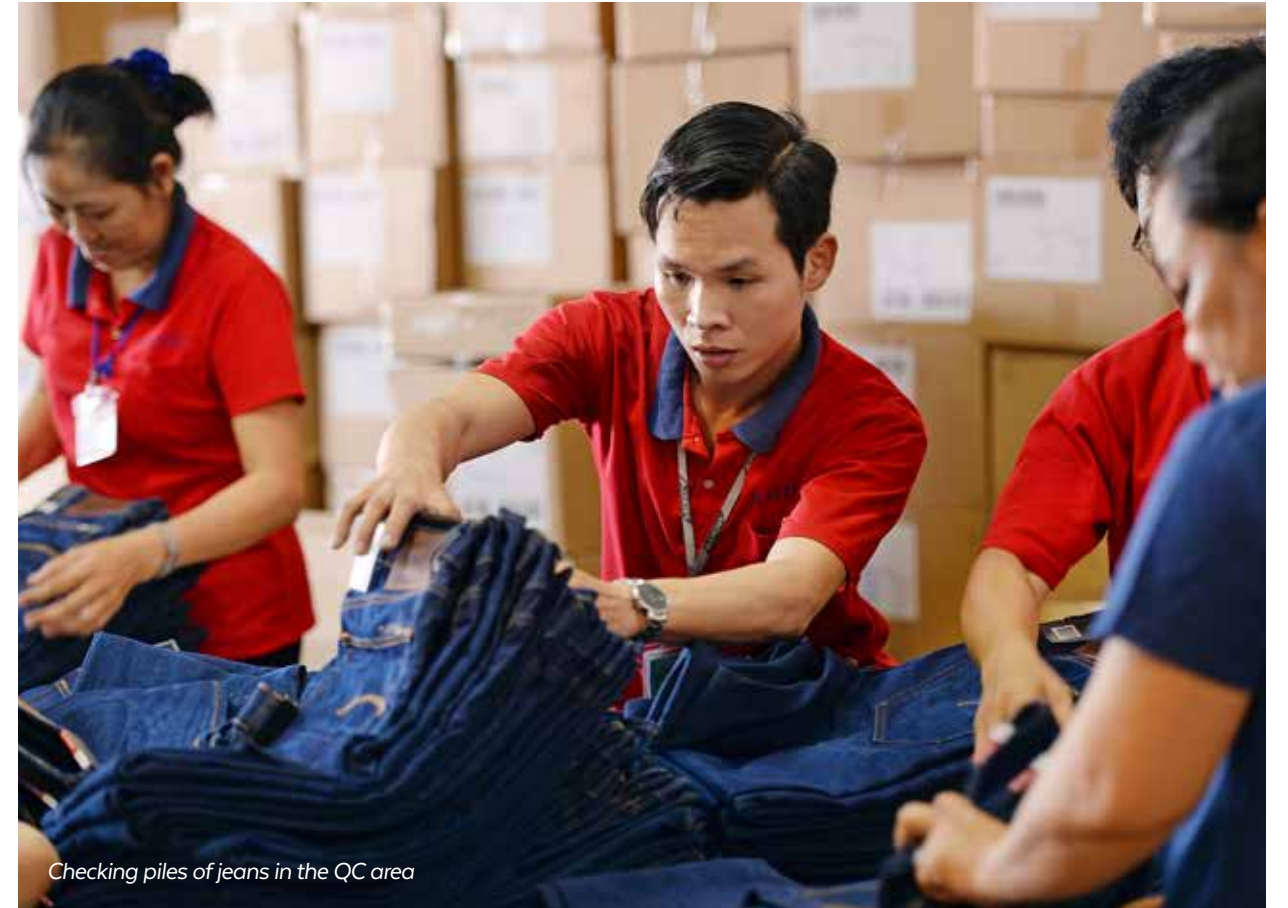
Checking piles of jeans in the QC area