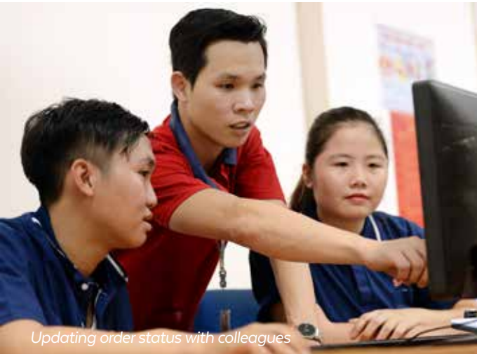
Updating order status with colleagues